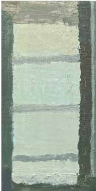
4. Laura Vahlberg, Curtain $500