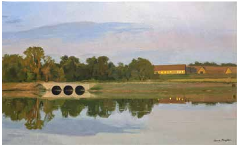
11. Elana Hagler, Hampstead Lake $7,875