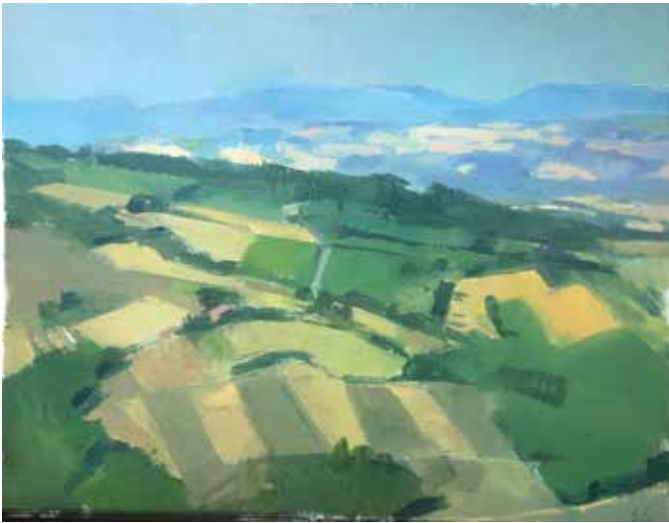
17. Elise Schweitzer, View Towards Marciano $900