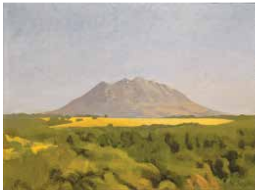
2. Elana Hagler, Monte Soratte $4200

Ronit Goldschmidt is a painter based in Tel-Aviv, Israel. She lived and painted in Germany and Italy. She mainly paints landscapes based on her surrounding landscapes, pictures and memories.