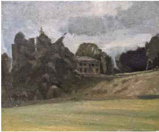
6. Conrad Frankel, Late summer, Creagh Castle $800