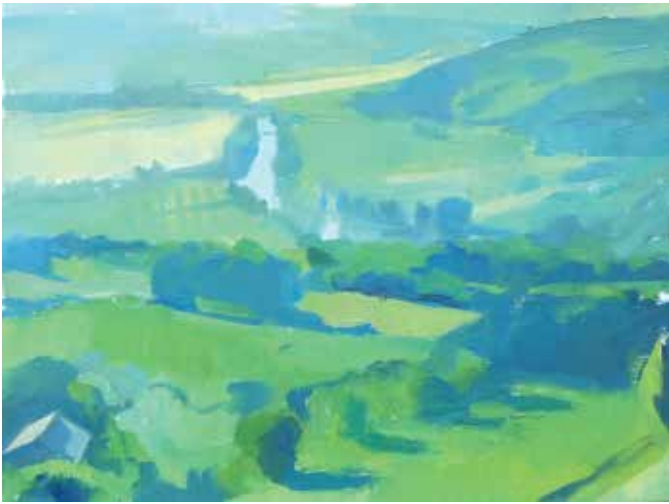
1. Elise Schweitzer, Tiber River, Morning $900