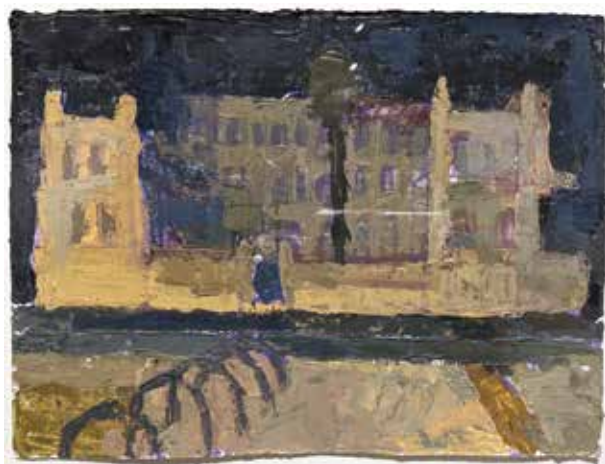
9. Yonatan Becker, Jerusalem at Night $1200