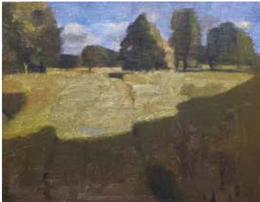
15. Conrad Frankel, Hazy Day $800