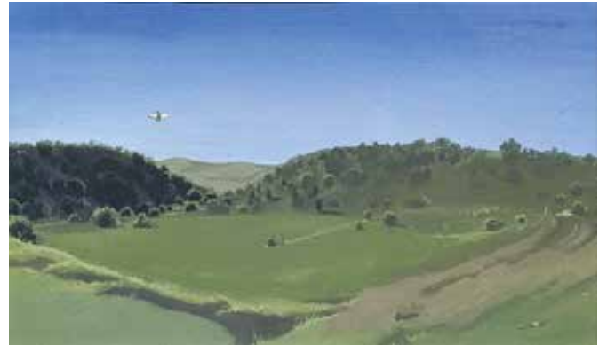
18. Ronit Goldschmidt, Landscape with Airplane $1000