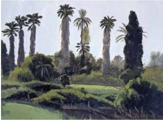
5. Ronit Goldschmidt, Landscape with Palm Trees $1000