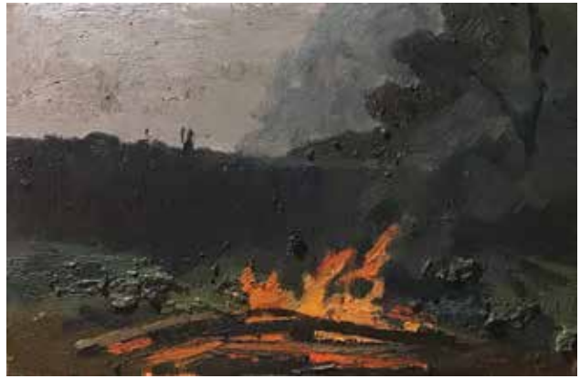
10. Conrad Frankel, Fall Fire $800