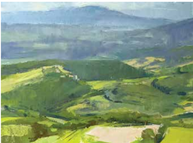
19. Elise Schweitzer, Soccer Field and Bell Tower $900