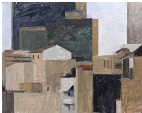
21. Lena Chermoshniuk, Neve Shaanan View $1200