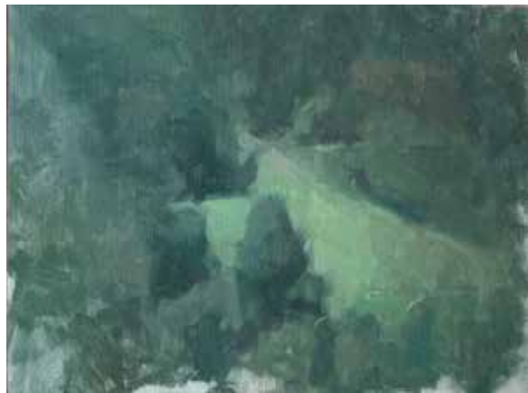
8. Clare Haward, Valley $1200